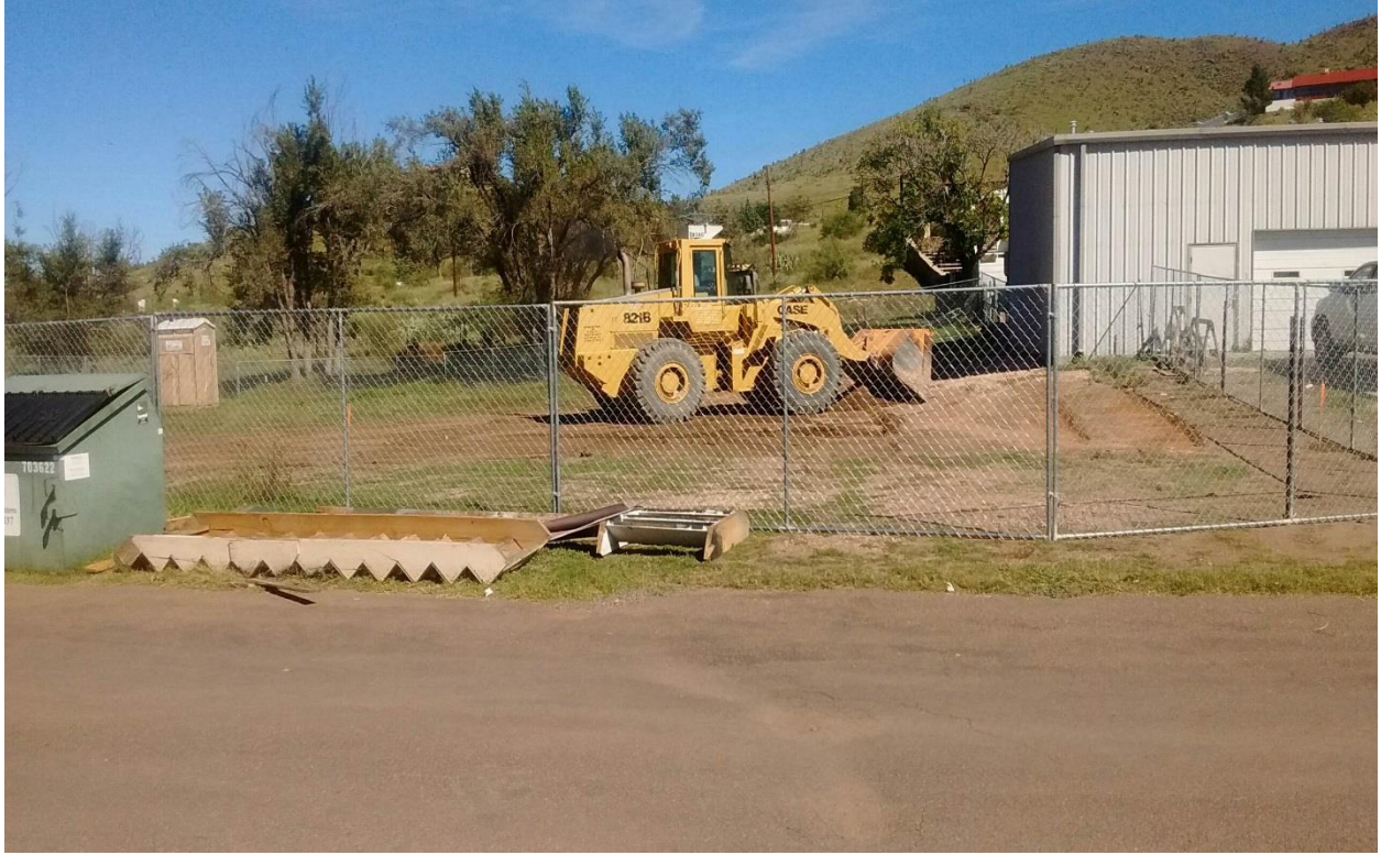
Site preparations continue (11-04-15)