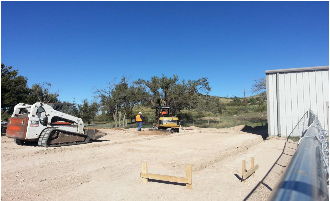
Foundation poured (11-13-15)