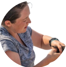
Range & Wildlife Management

"I have a passion for fitness, health, & wellness .. Growing up I stayed active by participating in a multitude of different sports; (basketball, volleyball, competitive swimming, karate, golf, baseball, soccer, weight lifting). I love to cook and bake for myself, my family, and friends."