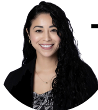
Education & Instructional Technology

"Writing holds a very special place in my heart, and with it I hope to portray the everyday details of life as I see it. It still haven't the faintest clue of what I want to do with my life, but I figured that's okay. Because that's certainly a part of living."