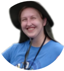
Range & Wildlife Management