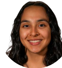
Health & Human Performance

"My dream is to complete a Master's Degree in Educational Leadership and pursue a Doctorate degree in Education."