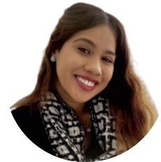
Education & Instructional Technology

" Discovering birding changed my life and drove me towards spreading a love for nature and conservation, and also generated a passion for research. Now, I'm on a mission of making birding and science accessible and educational, and driving towards my eventual PhD."