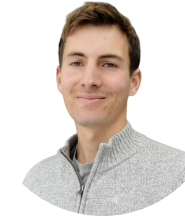
Natural Resources Management

" I enjoy reading self - development books and last year committed to reading one book a month. On my downtime I enjoy taking nature walks and journaling."